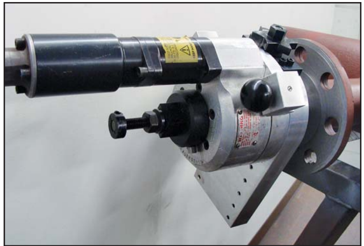
Mactech's Mini Flange Facer

Mactech's compact and reliable Mini Flange Facer is an easy to use portable flange facer for resurfacing pipe and tube flanges, with no special training required. The Mini Flange Facer rigidly mounts to the inside diameter of the pipe for stable and accurate machining. The self-centering draw rod makes installation quick and easy. This amazingly powerful and versatile tool cuts through the toughest material, and works on a wide range of face diameters. Cutter blades machine smoothly, without requiring cutting fluids. The Mini Flange Facer produces a clean, continuous chip, and squares off the end of the pipe. For resurfacing pipe and tube flanges, Mactech's Mini Flange Facer is the solution.